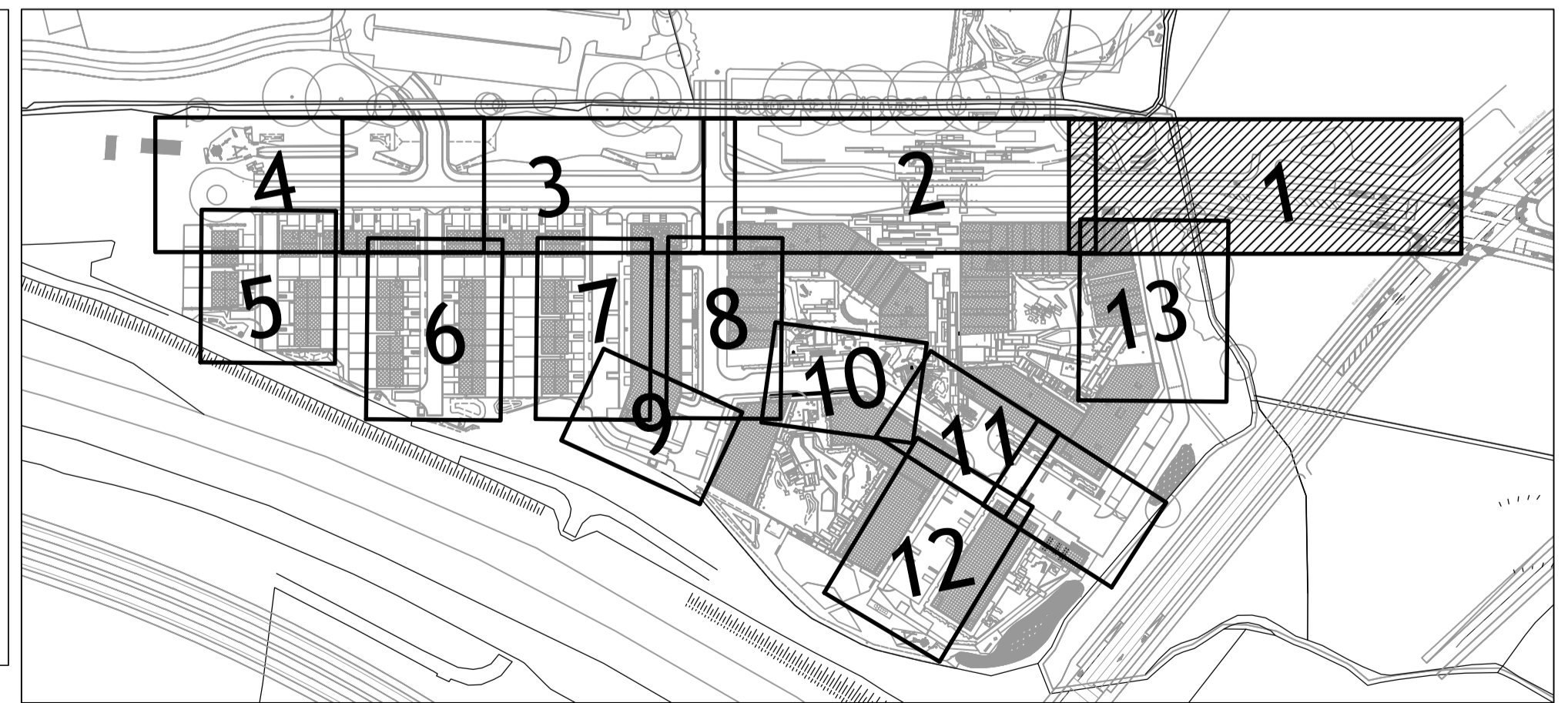
KEYPLAN SCALE: NOT TO SCALE

© PUNCH Consulting Engineers This drawing and any design hereon is the copyright of the Consultants and must not be reproduced without their written consent. All drawings remain the property of the Consultants. Figured dimension only to be taken from this drawing. Consultants to be informed immediately of any discrepancies before work proceeds.